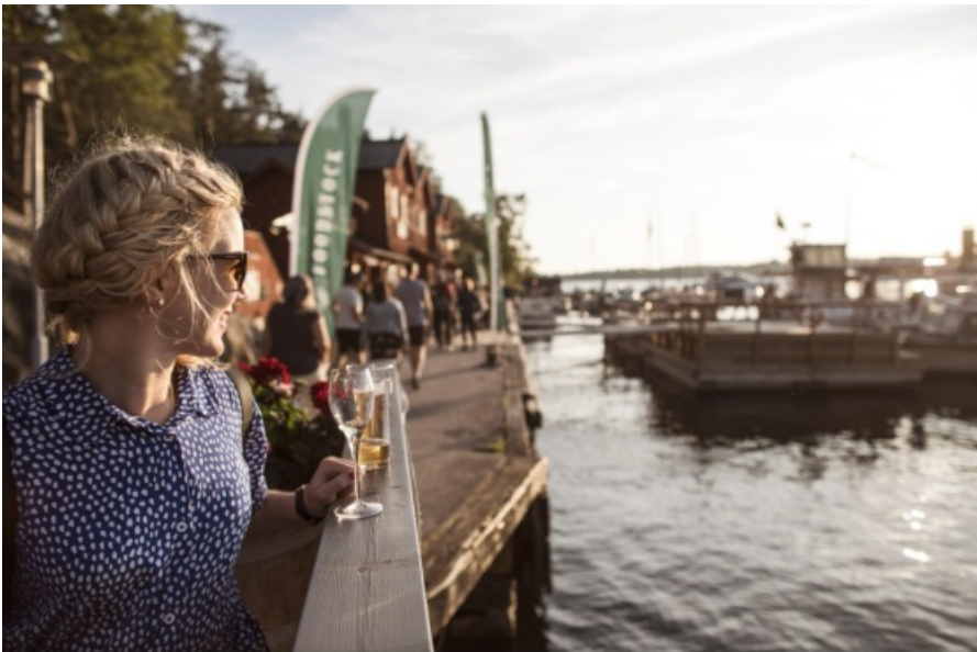
An evening drink on the jetty at the island of Fjäderholmarna in the archipelago