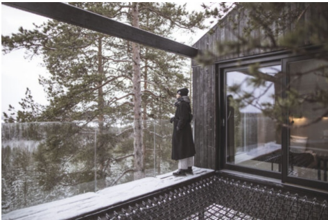
Tree Hotel.

If you like Tree Hotel in the heart of Swedish Lapland, then the new, 400 square meter villa opening on 21 December 2025 is likely for you. It sees Jenny Isaaksson at the helm, daughter of the Tree Hotel founders.