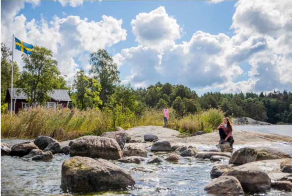
Photo: Summer holiday on an island in the archipelago / Tina Axelsson/imagebank.sweden.se ( Download )