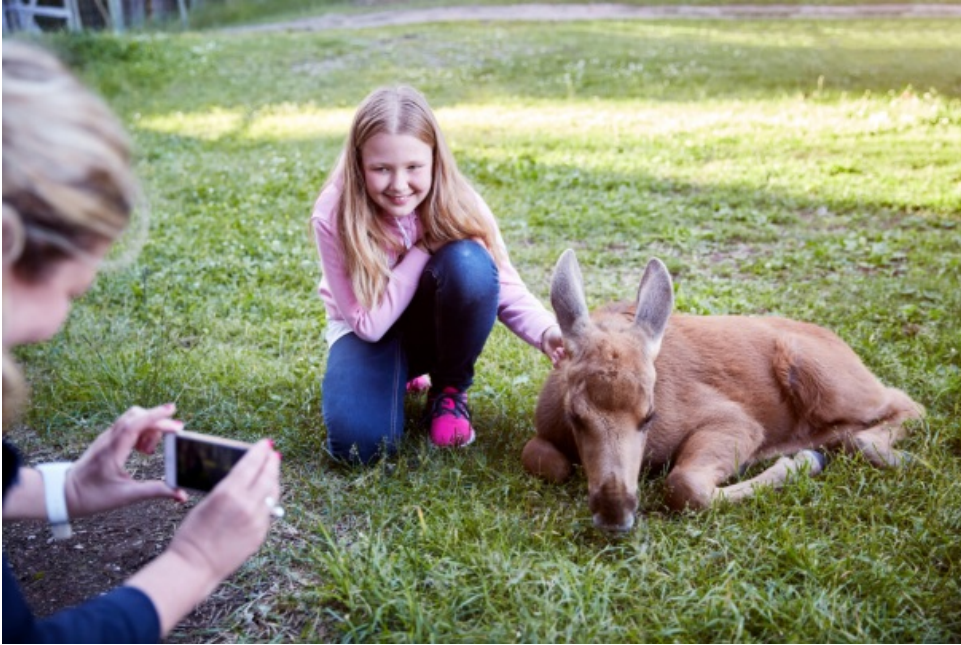
Meeting a baby moose in Småland. (Download)