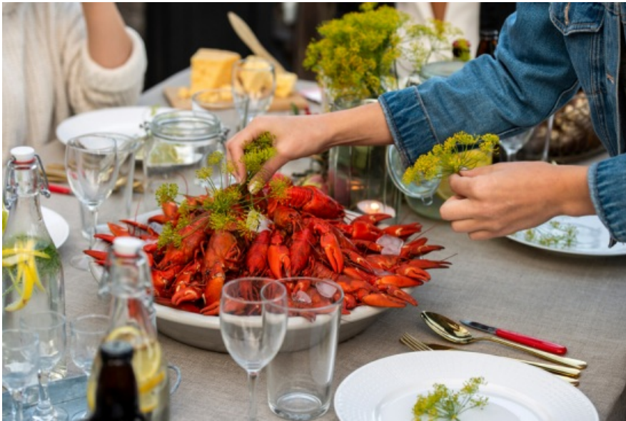
Photo: Crayfish Party. Credit -Anna Hållams/imagebank.sweden.se ( Download )

More information at: https://visitsweden.com/what-to-do/roundtrips/wilderness-road/ and https://www.vildmarksvagen.se/7348.html