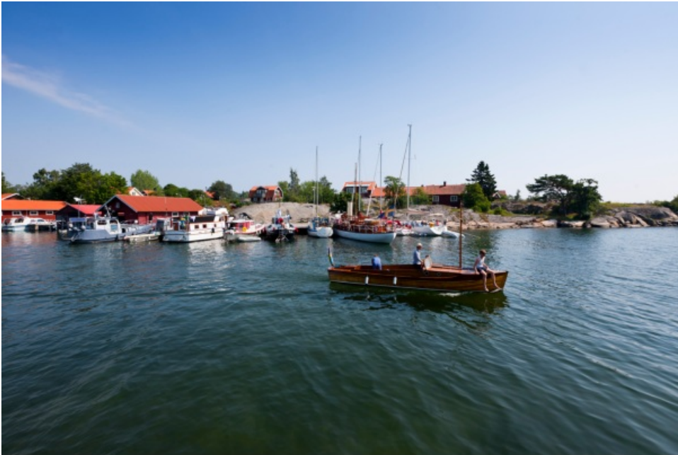
Photo: Boats at Möja island ( Download )

More top tips on Stockholm's Gastronomic archipelago can be found at: https://www.visitstockholm.com/eat-drink/restaurants/gastronomic-archipelago/